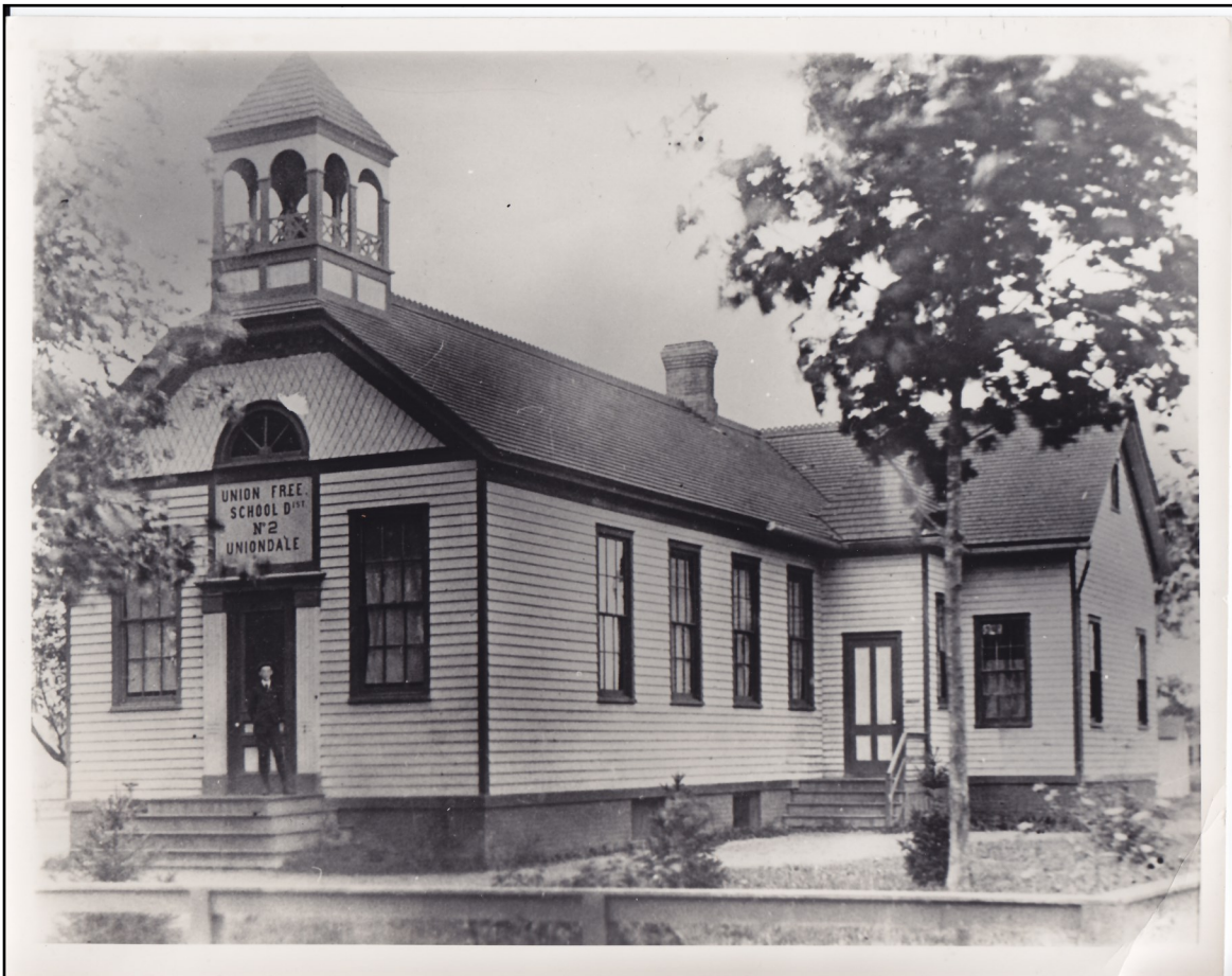
This three room building served the Uniondale Community for decades, first as a school as pictured, then as a church and finally as home to Uniondale's first public library.

Located at the corner of Uniondale Ave., and Cedar St., Uniondale, the school building most likely began its task of educating children as a one room school house in the middle of the 19th century. As the population grew, the cross wings were added resulting in this three room structure. We have no date to assign to this photo or the building itself, but we have another similar photo where the trees are larger and we know that the building was moved in the early 1900's to make room for a brick, eight room school on the property. We also know that the cornerstone for what eventually became known in the community as School #1, or the Cedar Street School was laid in 1908. While construction took place, students attended classes in the above building then located on Uniondale Ave. in the parking lot currently across from the Unondale Public Library.