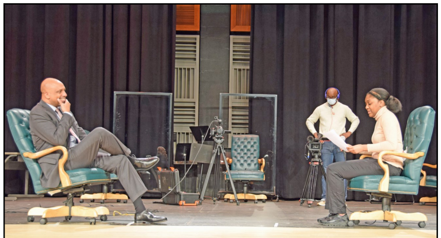
A video “studio” was set up on the stage in the HS auditorium.