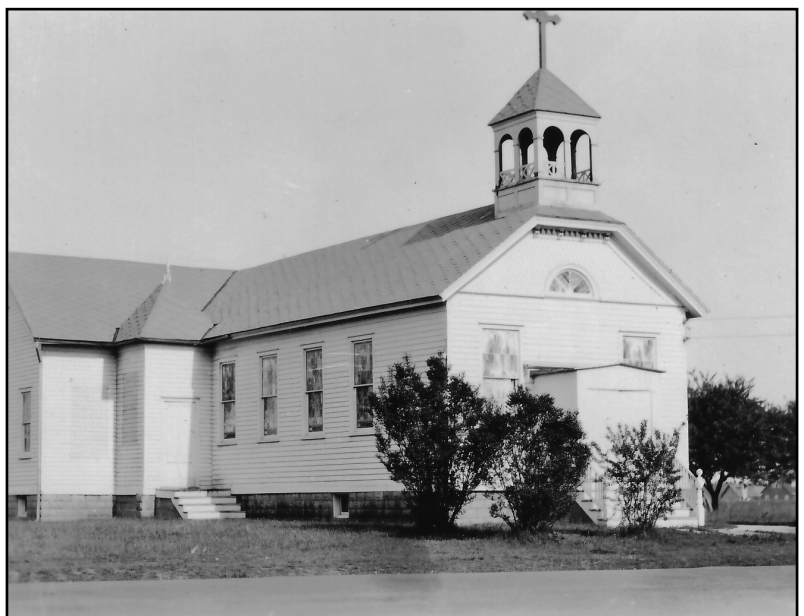
St. Martha's in 1927.

Once the new school was completed, the building was dedicated as a chapel, named for St. Catherine of Sienna, as part of the Roman Catholic parish of Our Lady of Lorretto in Hempstead. By 1915, the church was renamed for St. Martha and Polish priests were assigned to service the Polish residents of the community. By the middle of the 1920s, a new larger church was built in Hempstead and the parish of St. Ladislaus was officially created.